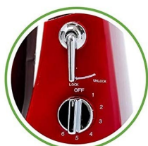
6 Precision Speed Control