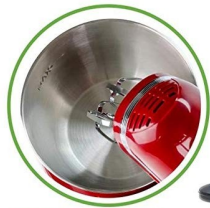
3.7 Quart Stainless Steel Capacity