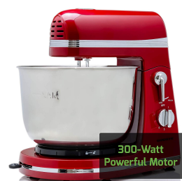
300-Watt Powerful Motor