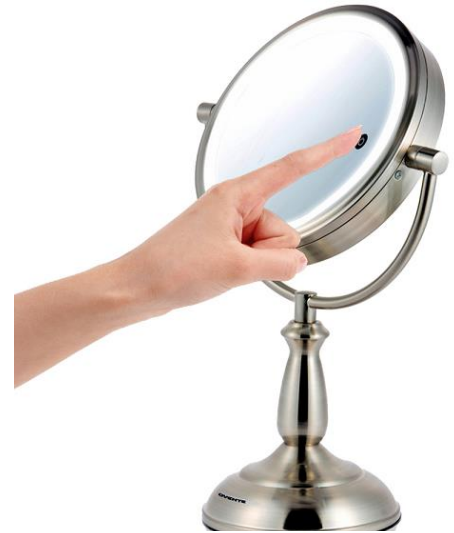
3 Tone LED Light