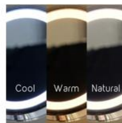
Multi-Touch Technology Enables switching between three-tone LED light option: Cool, Warm and Natural