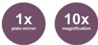
1x/10x Magnification Dual Sided 1x/10x Optical Quality Mirrors