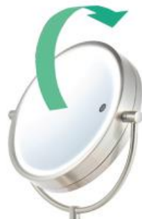
360° Swivel Rotation with Tilt Head Design For easy viewing at any angle