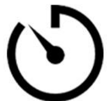
15-Minute Auto Shut-off Built-in energy saving timer that shuts it off after 15 minutes of use for extended battery life